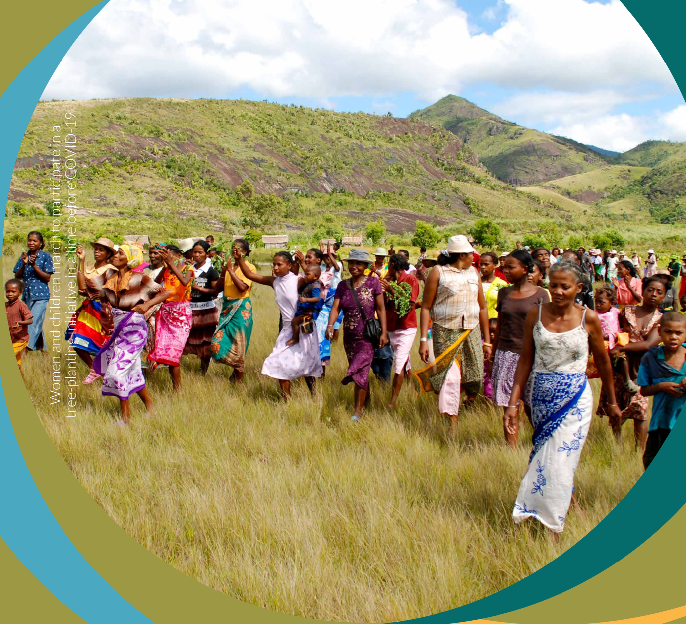
Women and children march to participate in a tree-planting initiative in a time before COVID-19